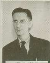
Chester Mau Printing