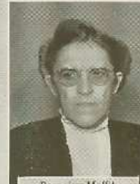
Berneise Moffit Clothing