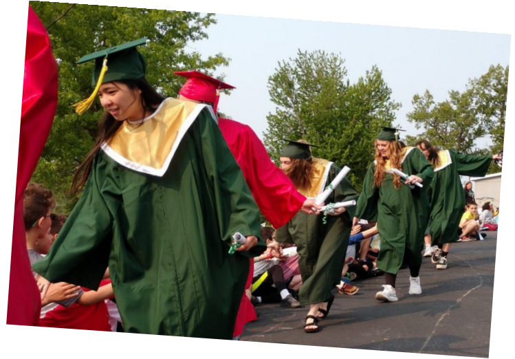
Senior Walk- May 20-22

Listen to the announcements for the sign up for Kennedy feeder school's walk. We will share information for Washington and Jefferson as it becomes available.