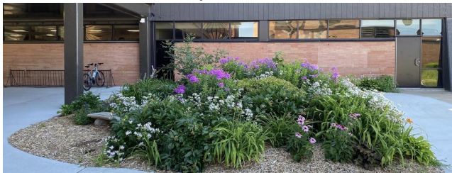
Flowerbed beautification, courtesy of WHS PTA

Washington's goal is to take every possible step to ensure all students' safety and be aligned with safety components of all other district high schools. When doing an evaluation of the school's current state of safety, the highest yield, easiest leverage point, and critical addition for our security was having a single-point of entry to our building during the school day. Therefore, the entryway was remodeled and improved. Going forward, the standard entries/ exits (gym, south lot, north lot, fine arts wing, café, and main entrances) will be open before school begins. After 7:50 a.m., all students, parents/guardians, and guests are to enter the building through the main entrance and check in with attendance or main office staff. The other doors in the building will be locked for the duration of the school day.