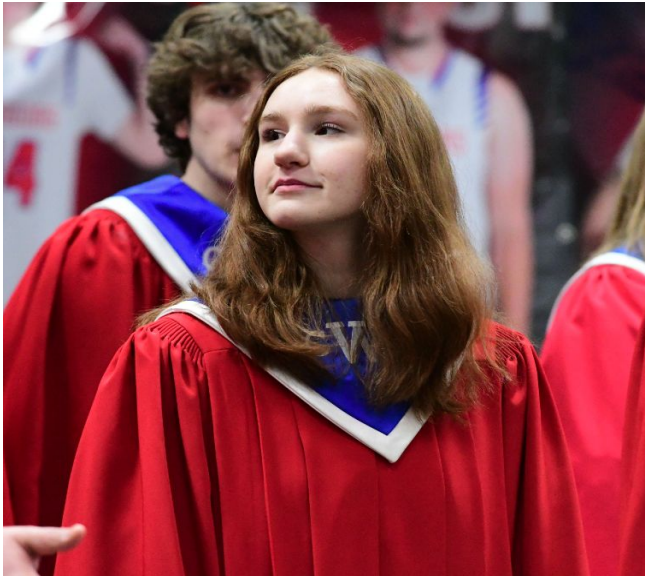
WHS Vocal Music