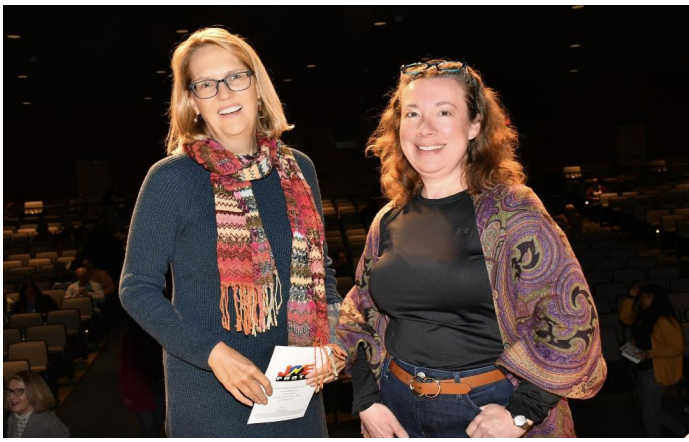
WHS PTA Members