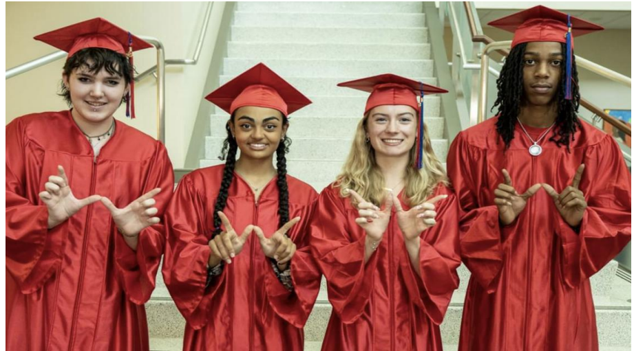
Class of 2023 Graduates