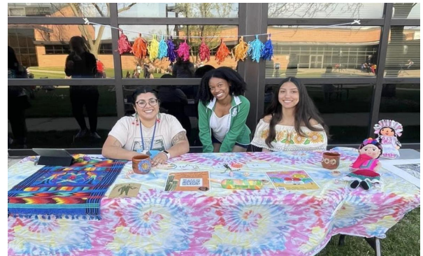
Maize Club for Latine & Indigenous students

The entire "Bullying and Harassment of Students" policy for the Cedar Rapids Community Schools (CRCS) is readily available by going to the CRCS home page and clicking on "policies and procedures" on the right side of the home page. Then click on policy 612.1.