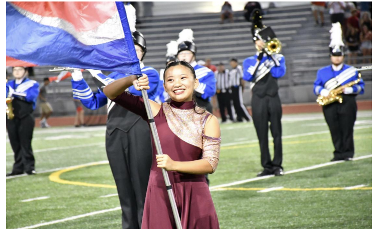
WHS Color Guard

November 2nd, November 5th, November 8th- 3:30-7:30 PM