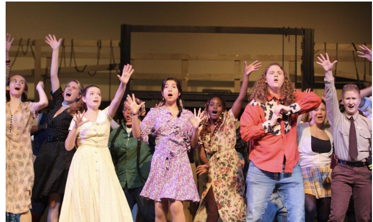
Bat Boy The Musical