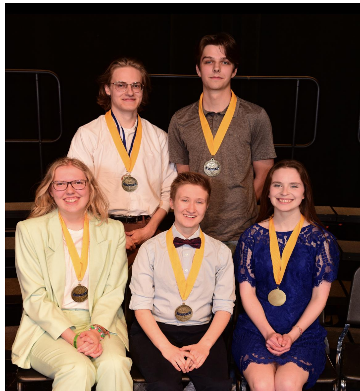
Class of 2023 Salutatorians Senior Recognition Ceremony

The District believes inappropriate student appearance causes material and substantial disruption to the school environment or presents a threat to the health and safety of students, employees and visitors. Students are expected to adhere to standards of cleanliness and dress that are compatible with the requirements of a good learning environment. The standards will be those generally acceptable to the community as appropriate in a school setting. The District expects students to be clean and well-groomed and wear clothes in good repair and appropriate for the time, place, and occasion. Clothing or other apparel promoting products illegal for use by minors and clothing displaying obscene material, profanity, or reference to prohibited conduct are disallowed. While the primary responsibility for appearance lies with the students and their parents/guardians, appearance disruptive to the education program will not be tolerated. When, in the judgment of a principal, a student's appearance or mode of dress disrupts the educational process or constitutes a threat to health or safety, the student may be required to make modifications or be subject to disciplinary action. The wearing of gang-related attire or insignia by students shall be prohibited.