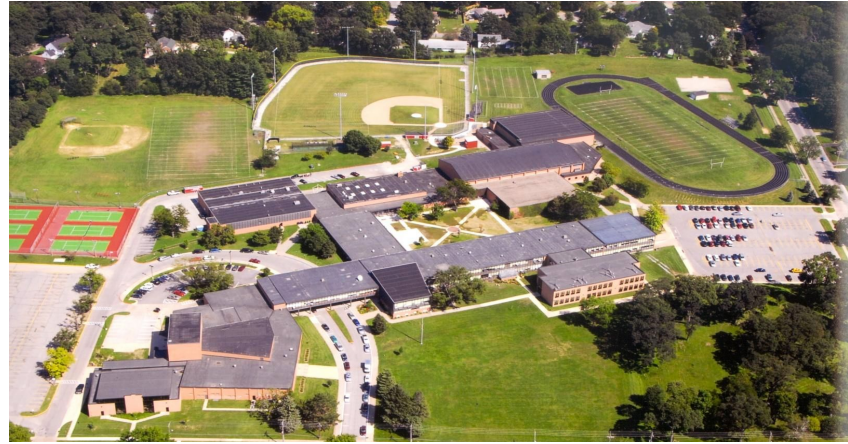
Present Day Campus Built in 1957