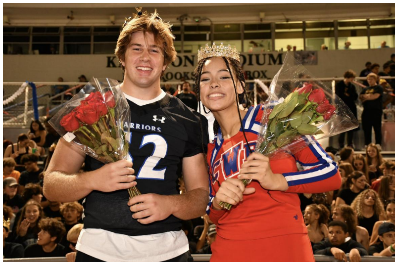
2023 Homecoming Royalty

Prom is typically held on a Saturday in late-April or early-May. Seniors in good standing may purchase prom tickets for themselves and 1 guest. Guests who are not current Washington students will need to register a week prior to the dance. Post-prom is hosted by PTA and is free for seniors and 1 guest. Additional information regarding prom will be available after spring break.