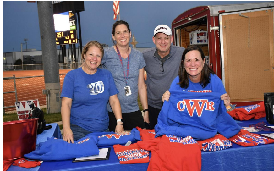
Warrior Athletic Club (WAC) Members