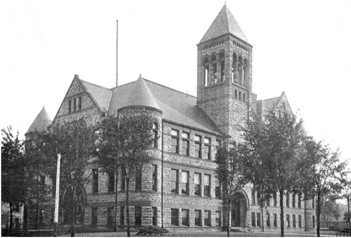
4th Avenue SE /Greene Square Campus 1855-1868