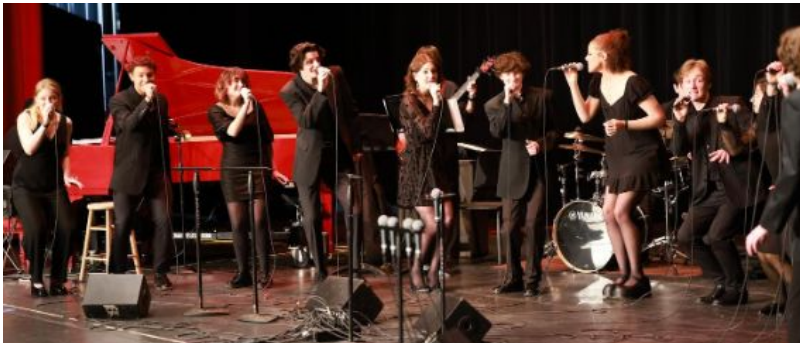
WHS Slice of Jazz