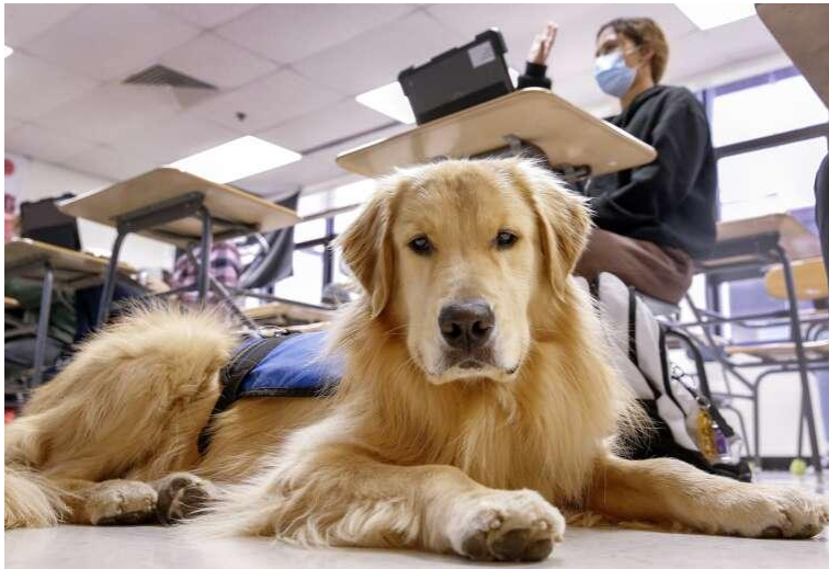
Bleu, WHS Service Dog

PARENT/TEACHER CONFERENCES: November 2nd, 6th, 8th, 9th